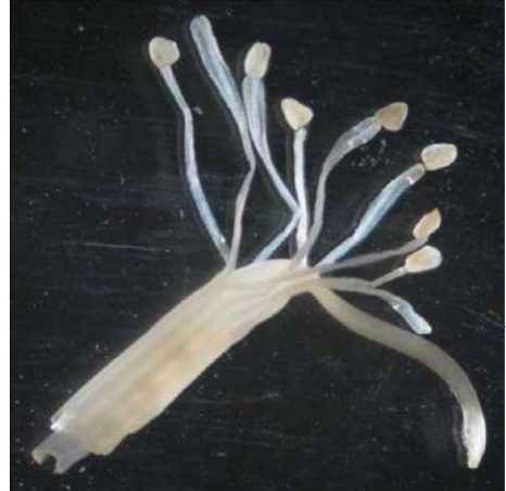
Figure I. Stamens of V. formosa en velopingpistil (lower right comer).

Androecium. As in many other legume species, the androecium in V. formosa is diadelphous, where nine filaments are fused together and anthers are spherical and two-pieced (Fig. 1). In some fully developed flowers only one or two filaments had anthers. In the case of fully developed flowers with regular