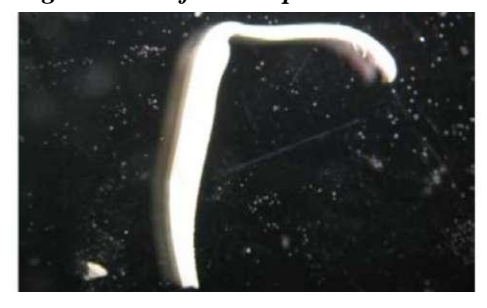
Figure 4. A dissected V. formosa ovary with 7 ovules